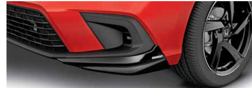
UnderBody Spoiler - FR

This accessory front underbody spoiler accentuates the sporty front bumper of the Civic. Lustrous gloss black creates a visual contrast with any color vehicle.