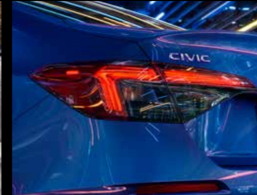
Tail lights: Using the latest LED technology, the brand-new design of the LED Tail lights give a dramatic effect.