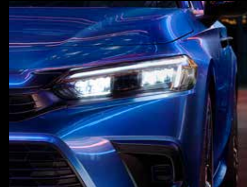
LED Headlights: The All-New Honda Civic has a full array of wide set LED headlights with Day Time Running Lights as standard.

The All-New 2022 Honda Civic boasts a clean, modern design paired with a high-tech, human-centered interior, and equipped with advanced active and passive safety systems.