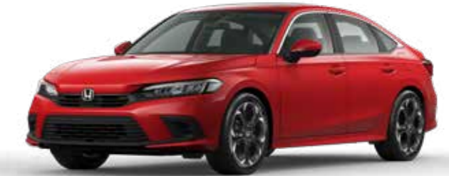
Coffee Cherry Red Metallic