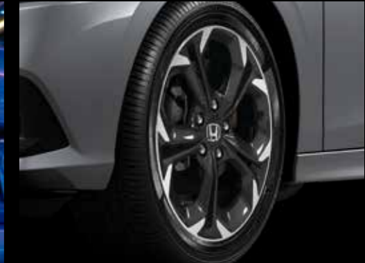
17" Alloy Wheels: The stylish 17" Alloy Wheels in the All-New Honda Civic gives it a bold and a stylish attitude.