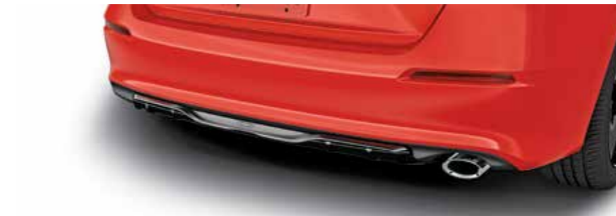
UnderBody Spoiler - RR

Customise your Civic with a low-profile, aerodynamic Rear Under Spoiler. Boasting a sporty style this enhances the dynamic look of your vehicle.