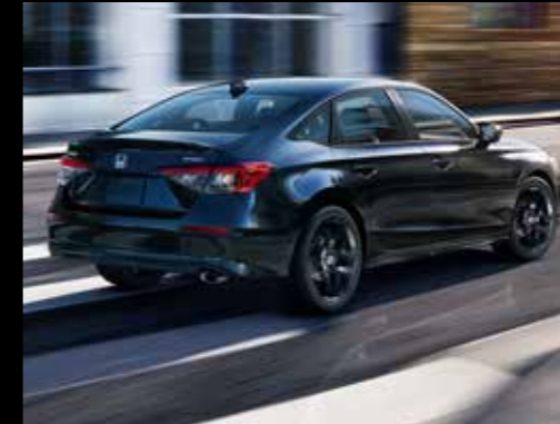
Fastback-Inspired Roofline: The graceful swoop of roofline, the elongated hood and the clean body lines, gives the Civic a patently sporty silhouette.