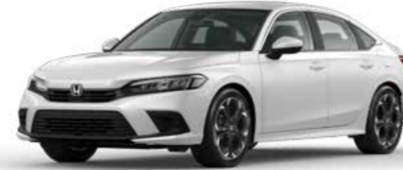
Platinum White Pearl