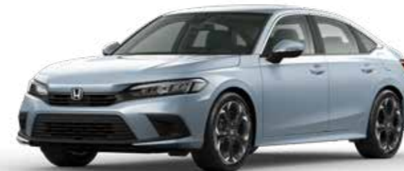
Morning Mist Blue Metallic