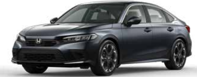
Meteoroid Gray Metallic