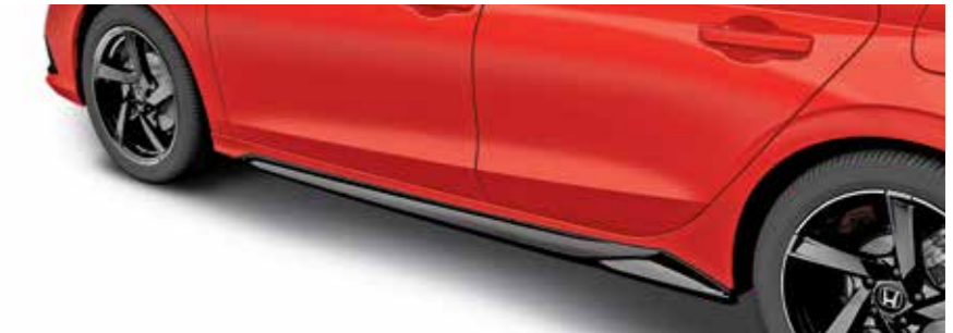
UnderBody Spoiler - SIDE

Make a head-turning impression as you cruise through the streets with a customised Side Under Spoiler. Sleek, sporty and aerodynamic, this stylish accent adds a personalised touch to your vehicle.