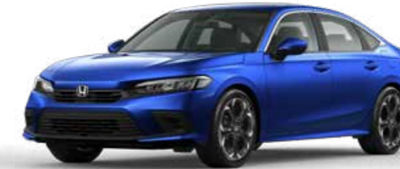
Brilliant Sporty Blue Metallic