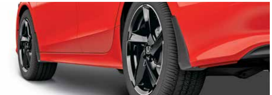
Mud Guard / Splash Guard

Tough and durable, they help protect your Civic from dirt and stone chips, also, complement the sleek line of your car with custom design.