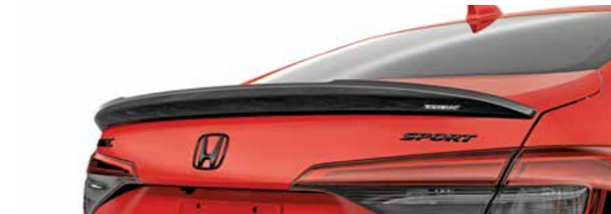
Trunk Spoiler / Declid Spoiler

Give your new Civic an aerodynamic exclamation point with this color-matched Honda Genuine Accessory. It makes a style statement like no other.