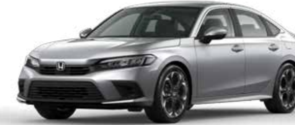
Lunar Silver Metallic