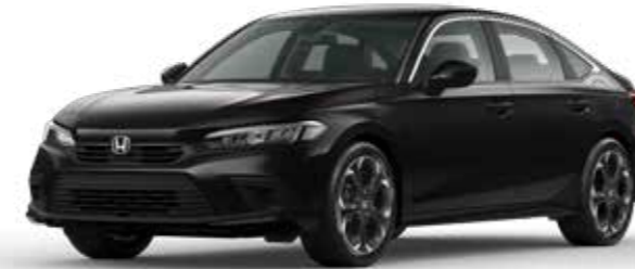
Crystal Black Pearl