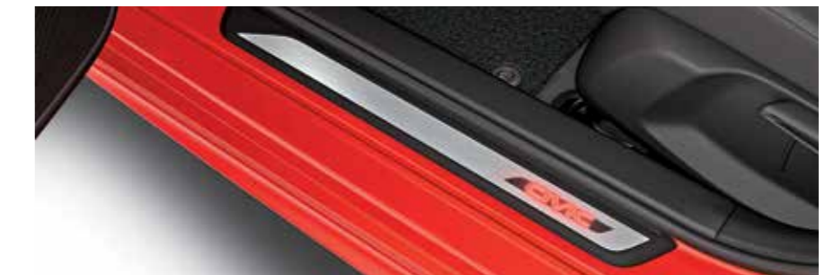
Side Step Illumi

Crafted in brushed stainless steel, the Illuminated Door Sill Trim steps up the interior, while, helping protect the lower door sill from scuff marks. These Illuminated Door Sills are activated when doors are opened. Includes Illuminated Front and Non-Illuminated Rear Trims.